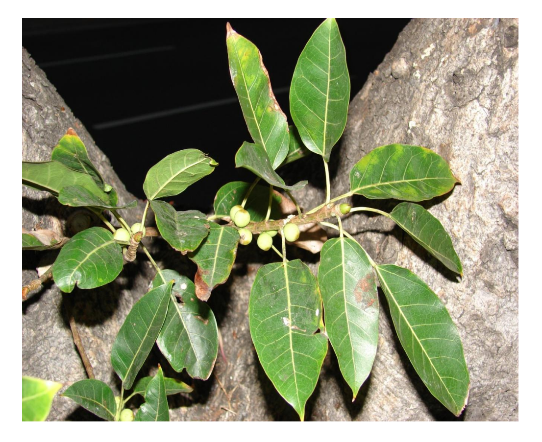
Figure 1: Leaves and bark of Ficus virens plant

Ficus virens (Moreaceae), commonly known as Pakad tree (Figure 1) is distributed throughout India, Pakistan, China and other tropical countries.<sup>4</sup> The bark contains Methyl ricinolate, Caffeic acid, Bergenin, \beta -sitosterol and lanosterol (Figure 2).<sup>5</sup> The bark is reported to possess antibacterial and antifungal activities. The leaf extract shows the presence of glycosides and tannins from the phytochemical analysis.<sup>6, 7</sup> Botanical classifications of Ficus virens is given in table 1.