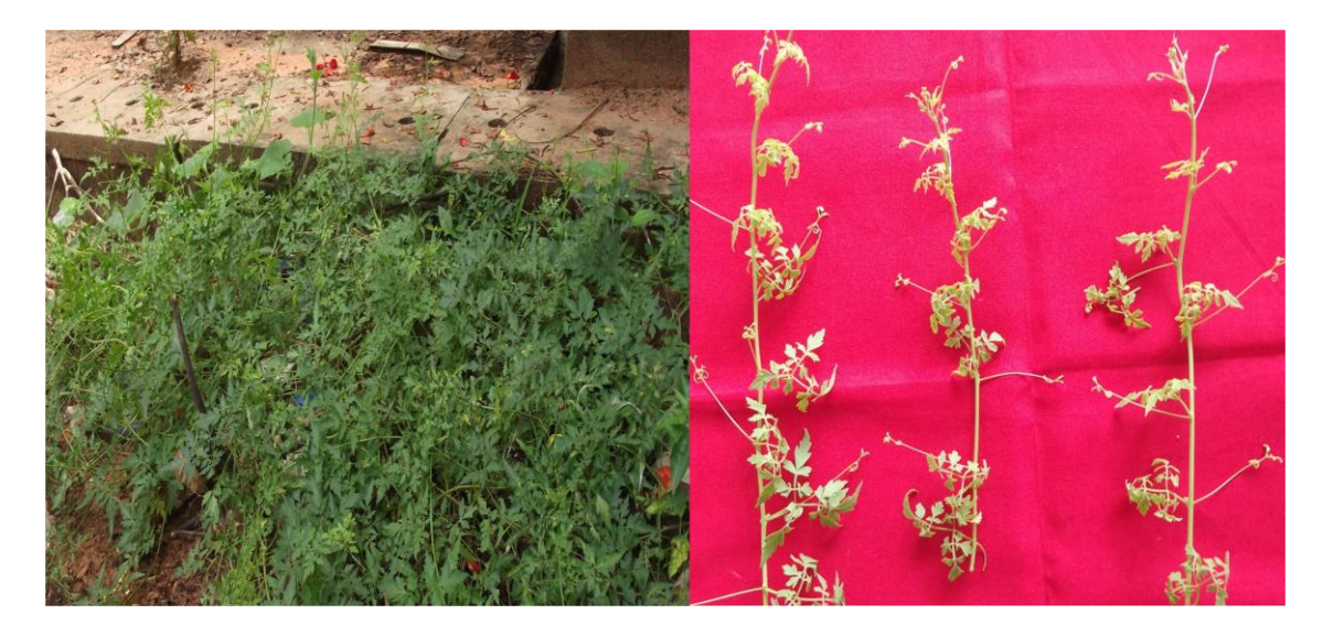
Figure 1: Cardiospermum halicacabum in nature and the fresh braches with leaves used in the present study

The color was changed in the cell free extract when challenged with 1mM AgNO3 from pale yellow to dark brown, attained maximum intensity after 10-12 hrs with intensity increasing during the period of incubation indicative of the formation of silver nanoparticles (Fig. 2B). Control (without silver ions) showed no change in