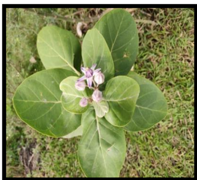
Figure 1: Calotropis procera plant

(The data is collected and assembled from https://plants.usda.gov/core/profile?symbol=CAPR )