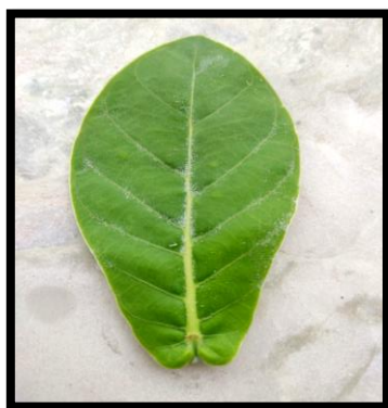
Figure 2: Leaf of C. procera