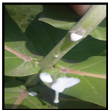
Figure 3: Latex of C. procera