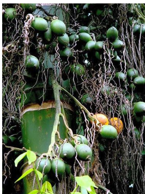
Figure 1: Areca catechu