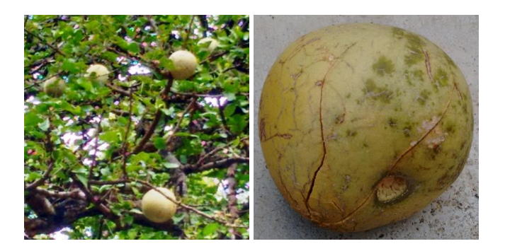
Figure 1: Fruits of Aegle marmelos