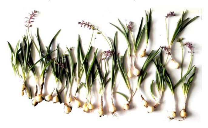
Figure 1: Collected plant material of Ledeboria hyderabadensis.

For the present study, the underground bulbs of Ledeboria hyderabadensis was collected at auditorium premises (17°24'55.8"N 78°31'48.6"E), Osmania University, Hyderabad, Telangana (Figure 1), India during mid-rainy (July-August) season. A voucher specimen (BSI/DRC/2018-19/Tech/348) was deposited in the Herbarium of Botanical Survey of India, Deccan section, Hyderabad, India.