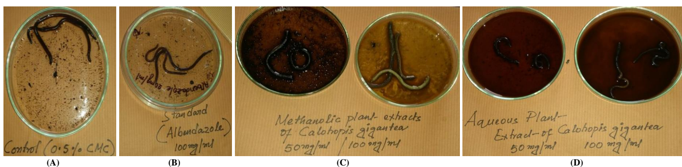
Figure 2: Anthelmintic activity of Calotropis gigantean leaves on Pheretima posthuma by A) Control B) Standard Albendazole C) different concentrations of methanolic extract D) different concentrations of aqueous extract.